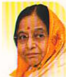
Hon'ble Smt. Pratibhatai Patil First Lady President of India Former President Vidya Bharati Shaikshanik Mandal, Amravati.