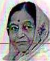
Hon'ble Smt. Prajibhatai Patil First Woman President of India Former President Vidya Bharati Shaikshanik Mandal, Amravati.