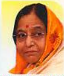
Hon'ble Smt. Pratibhatai Patil First Woman President of India Former President Vidya Bharati Shaikshanik Mandal, Amravati.