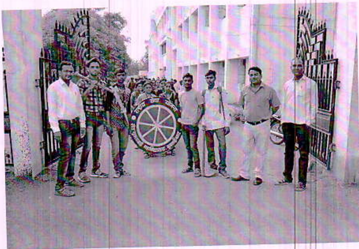
Swachta Rally from College

To observe the Swachta Pakhwara, the cleanliness rally and mass awareness programme was organized in Sambodhi Nagar, a slum area. A rally was marched from college to Sambodhi Nagar at 9:00 am in the morning.