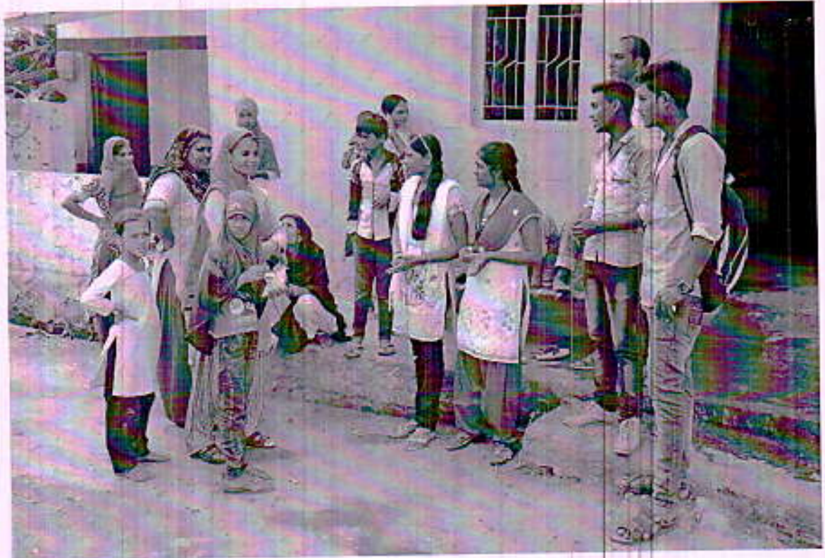
NSS Volunteers with local people.