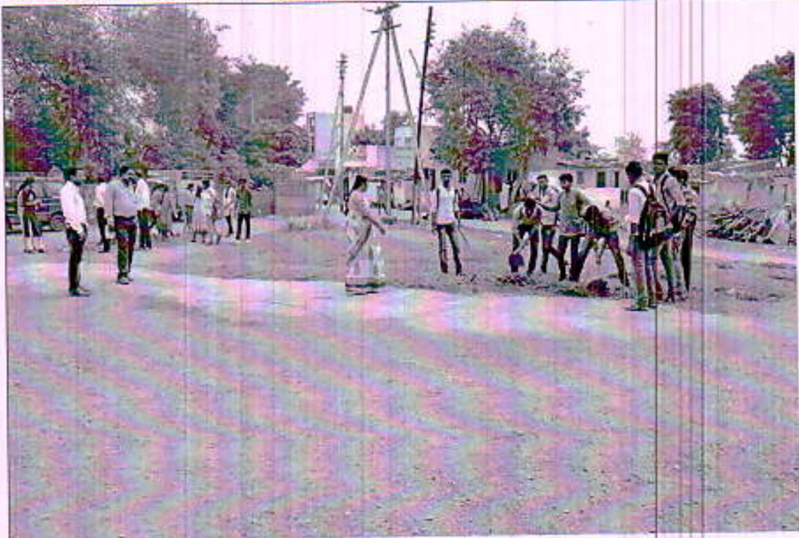
The cleaned ground of the Mosque