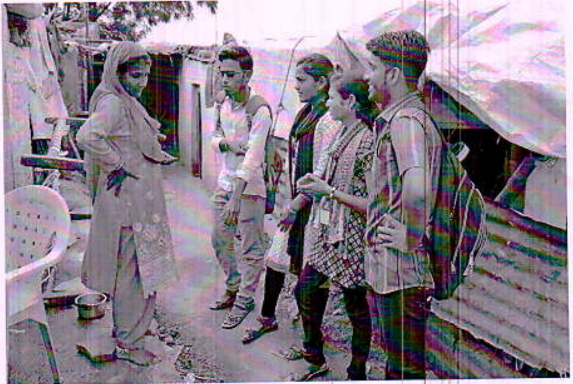
NSS Volunteers with a lady