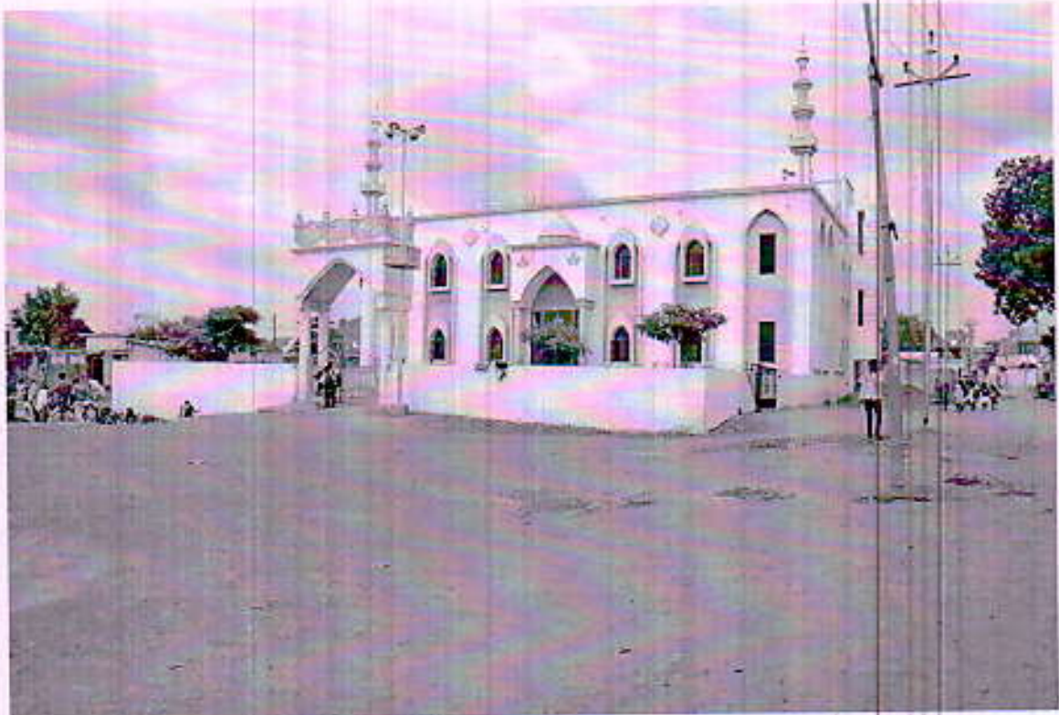
The cleaned Mosque by NSS Vounteers