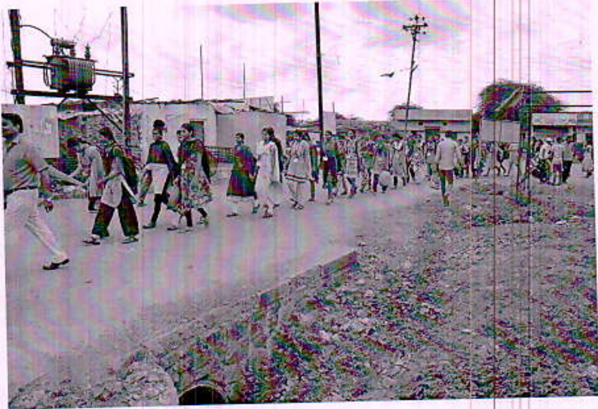
Rally to Sambodhi Nagar, a slum Area.